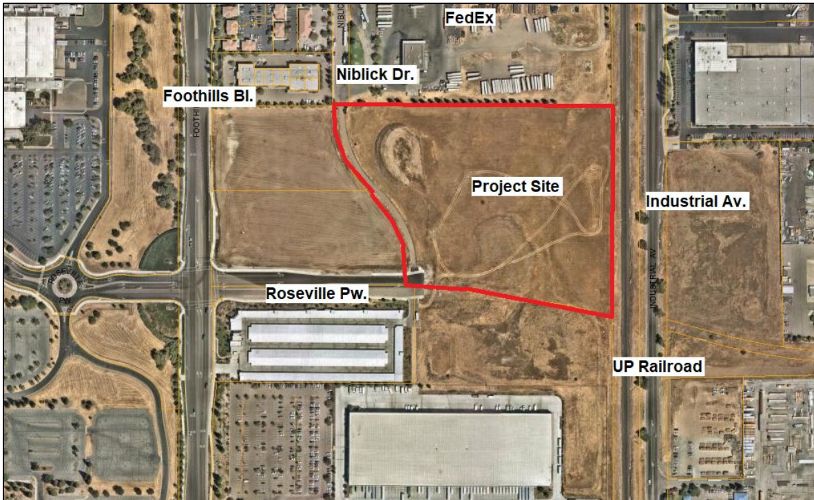
Figure 1 – Project Location

The project request includes a Design Review Permit to evaluate a proposed 206,785-square-foot, 41-foot-tall warehouse building and associated site improvements. As proposed, the plan includes a total of four (4) potential offices, 42 loading dock doors on the north side of the building, and a total of 233 parking stalls.